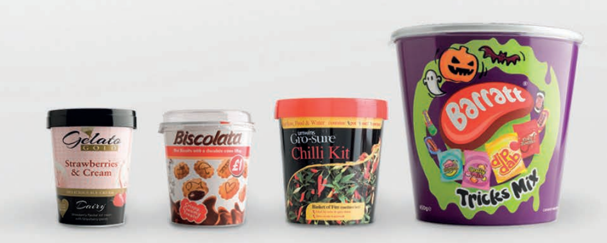
With Offset Prin