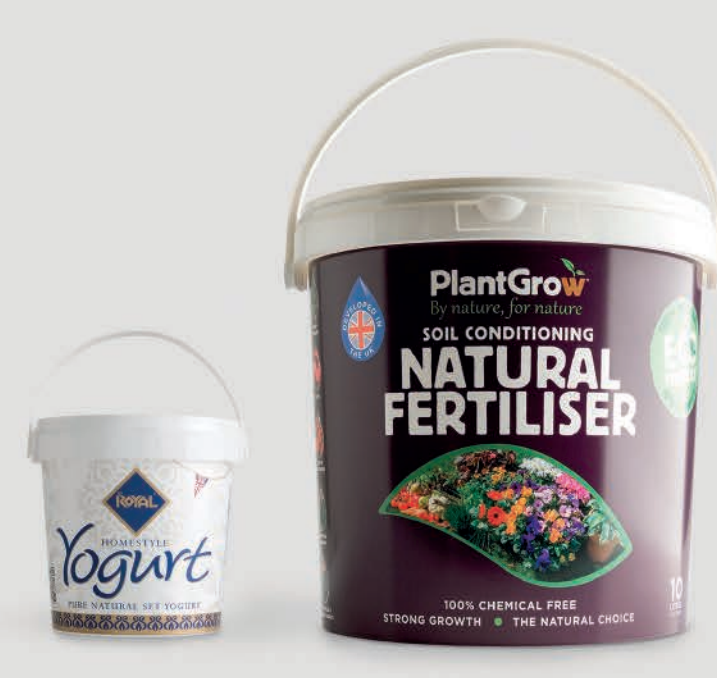
With In Mould Labelling and Offset Print