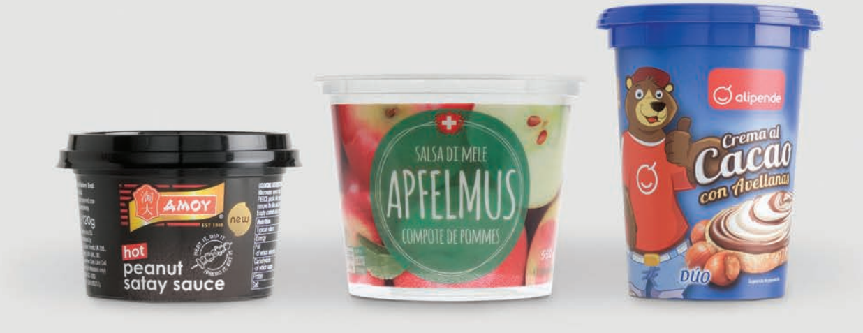
With In Mould Labelling