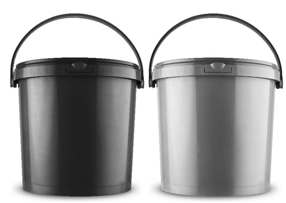
*Items available in black or grey